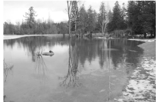
Rain and mild temperatures caused the Pefferlaw River to overflow on Otter Cove.

issued a flood warning on Wednesday, February 21 after receiving reports of flooding in